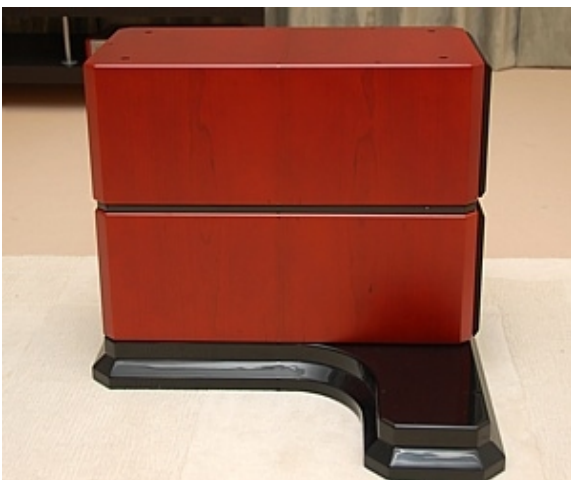
M3Pro i 's modular woofer sections

Transmission Audio is pleased to present the new M3Pro i , a reinterpretation of designer Bo Bengtsson's earlier R1. This speaker has now been completely reworked and we are happy to present the brand-new M3 Pro i . The picture to the left illustrates one of many possible finishes. Please note that the picture shows the speaker with the woofer grille cloths on.