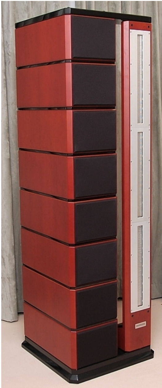
M3Pro i without ribbon grille cover